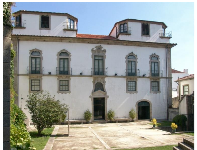
Guerra Junqueiro House Museum